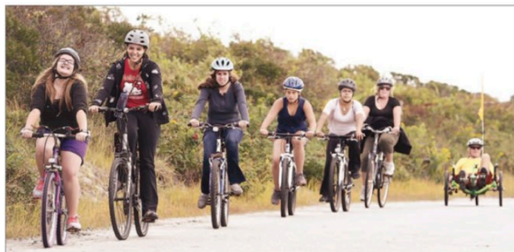
A bike tour led by Bike Newport and sponsored by the PUSH (Peer Union for Safety and Health) Youth Committee introduced new military students to Middletown on Sunday afternoon. Participants, above and below, are seen on Third Beach Road in Middletown.